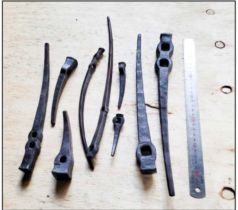
'Needles' all have a blunt point.

Length: Average might be 100 - 400mm long. In our testing we found shorter chunkier needles tend to look better than long thin ones when assembled.